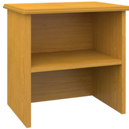
Model: COBH 20.5W 11.75D 20H

Evoking a sense of stately country grace, the gently radiused corners, overlay door and drawer design and OG edging make the Cotswold Collection ideal for use in resident rooms. Bead board inlays provide an elegant detail. This collection is available in a wide array of wood-grained finishes.